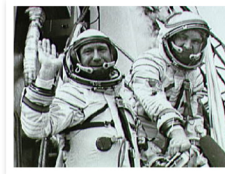
First spacewalk (USSR) Alexey Leonov March 1965