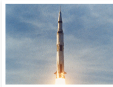
First manned spacecraft to orbit the Moon (USA) Apollo 8 December 1968