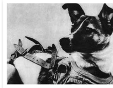
First animal in space (USSR) Laika the dog November 1957