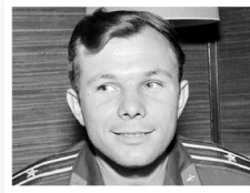
First human in space (USSR) Yuri Gagarin April 1961