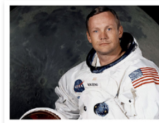
First person to step on the Moon (USA) Neil Armstrong July 1969